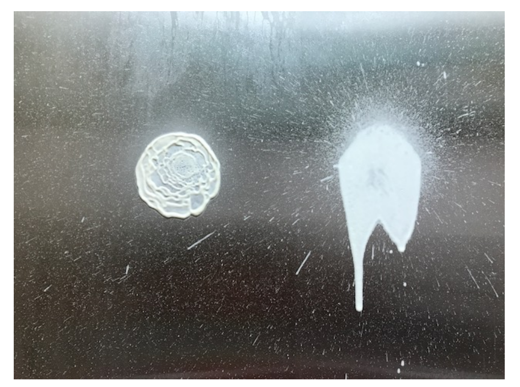
Service Pro vs Leading Competitor